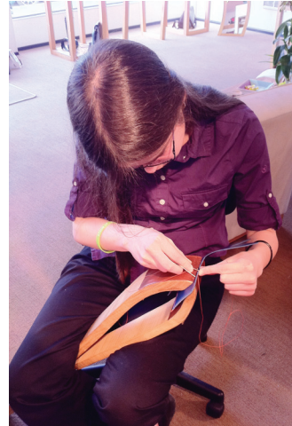
An INL apprentice at work

Yes, mentors will receive an orientation to the program through PEN where they will learn